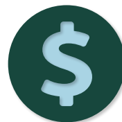
Cost of Living